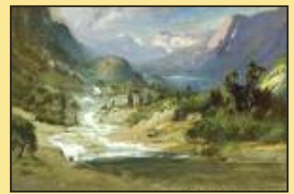
William Keith, Collection of the SMC MoA

In 1907, William Keith accompanied John Muir to Yosemite's twin valley, Hetch Hetchy. This trip was a desperate last stand for the preservation of the valley. The plan to dam the Hetch Hetchy Valley had brewed for decades, spiced with controversy and corruption. The fate of the valley was a national reflection, preservationist versus conservationist, municipal versus national authority, over the American soul.